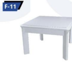
F-11 Coffee Table 65X65X40 cm.