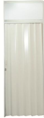
FOLDING DOOR 100x200 CM (SYSTEM BUILT)