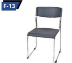
F-13 Fiber Chair 50X50X50 / 80 cm.