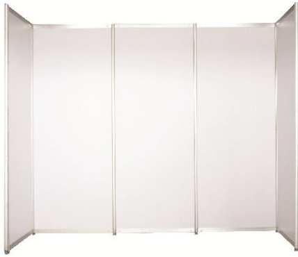
PANEL 100x250 CM (SYSTEM BUILT)