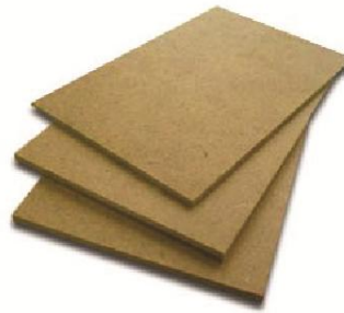
WOOD PLATFORM WITHOUT CARPET