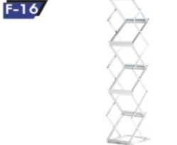
F-16 Brochure Stand 25 x 37 x 150 cm.