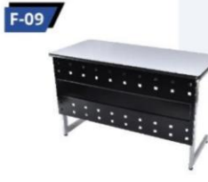
F-09 Receptionist Desk 55X120X75 cm.