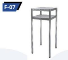
F-07 Product Shelf 50X50X120 cm.