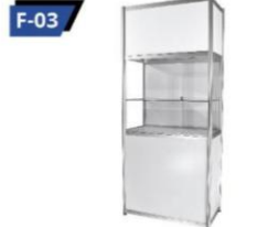
F-03 Big Showcase 50X100X250 cm.