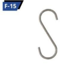
F-15 S-Hook 6.5 cm.