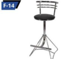
F-14 Black Stool 50X50X85 / 120 cm.