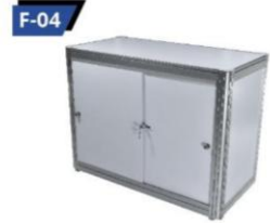
F-04 Lockable Cabinet 50X100X75 cm.