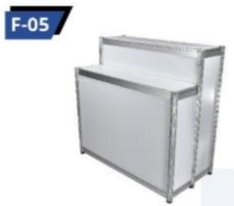
F-05 2 - Tier Counter 50X100X100 / 120 cm.