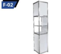
F-02 Tall Showcase 50X50X250 cm.