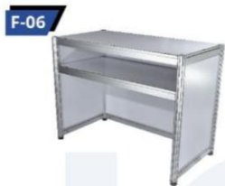
F-06 Counter 50X100X75 / 100 cm.