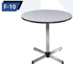
F-10 Round Table 75X75X75 cm.