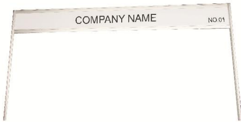
FASCIA BOARD WITH STANDARD LETTERING 10CM. HIGH 100x30 CM