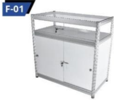
F-01 Counter Showcase 50X100X100 cm.