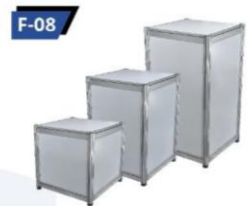
F-08 Display Stand 50X50X50 / 75 / 100 cm.